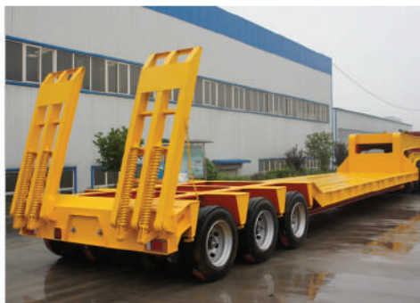
LOW BED TRAILER HEAVY LOAD MOVEMENTS