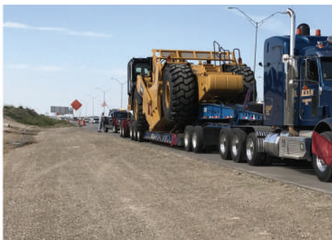
HEAVY HAUL TRAILER OVERSIZED MOVEMENTS

Our drivers are trained and equipped to carry high, wide and long loads and are available for deliveries 24/7 to any out-of-town or city centre sites throughout the region. We are specialising in logistics for the core sectors of industry. We have invested in a brand new, modern fleet comprising standard, flat and trombone trailers specially designed to meet the requirements of all customers.