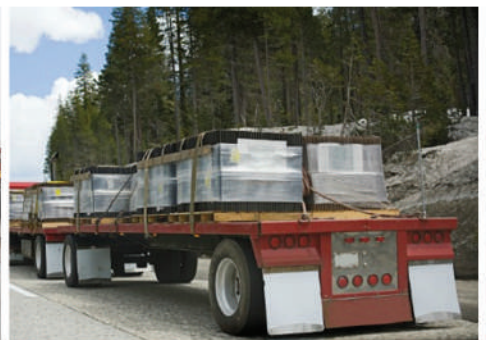
FLAT BED TRAILER BULKY COMMERCIAL LOAD MOVEMENTS